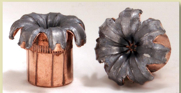
135 gr Gold Dot HPs fired into gelatin from 2" S&W 38 Spl revolver (average velocity = 861 ft/sec)

Bold type denotes MAXIMUM loads; use with caution.